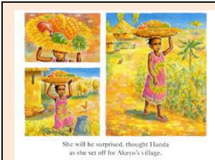
She will be surprised, thought Handa as she set off for Akeyo's village.

Write 4 sentences to compare Africa and the South Pole. Try to use and / but or because to extend your sentences.