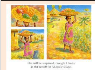
She will be surprised, though Handa as she set off for Akeyo's village.

Write 4 sentences to compare Africa and the South Pole. Try to use and / but or because to extend your sentences.