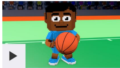
Physical Education KS1 / KS2: Hybrid Sports - Attacking and Defending

https://www.bbc.co.uk/teach/class-clips-video/physical-education-ks1-ks2-lets-get-active/z72yjhv