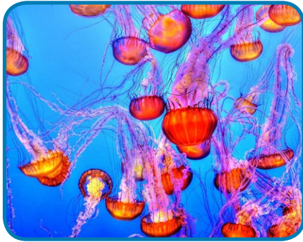
A bloom of jellyfish.

Most jellyfish like to live in groups. A group of jellyfish is called a 'bloom'. Large blooms can have thousands of jellyfish in them. Blooms move together and look for food.