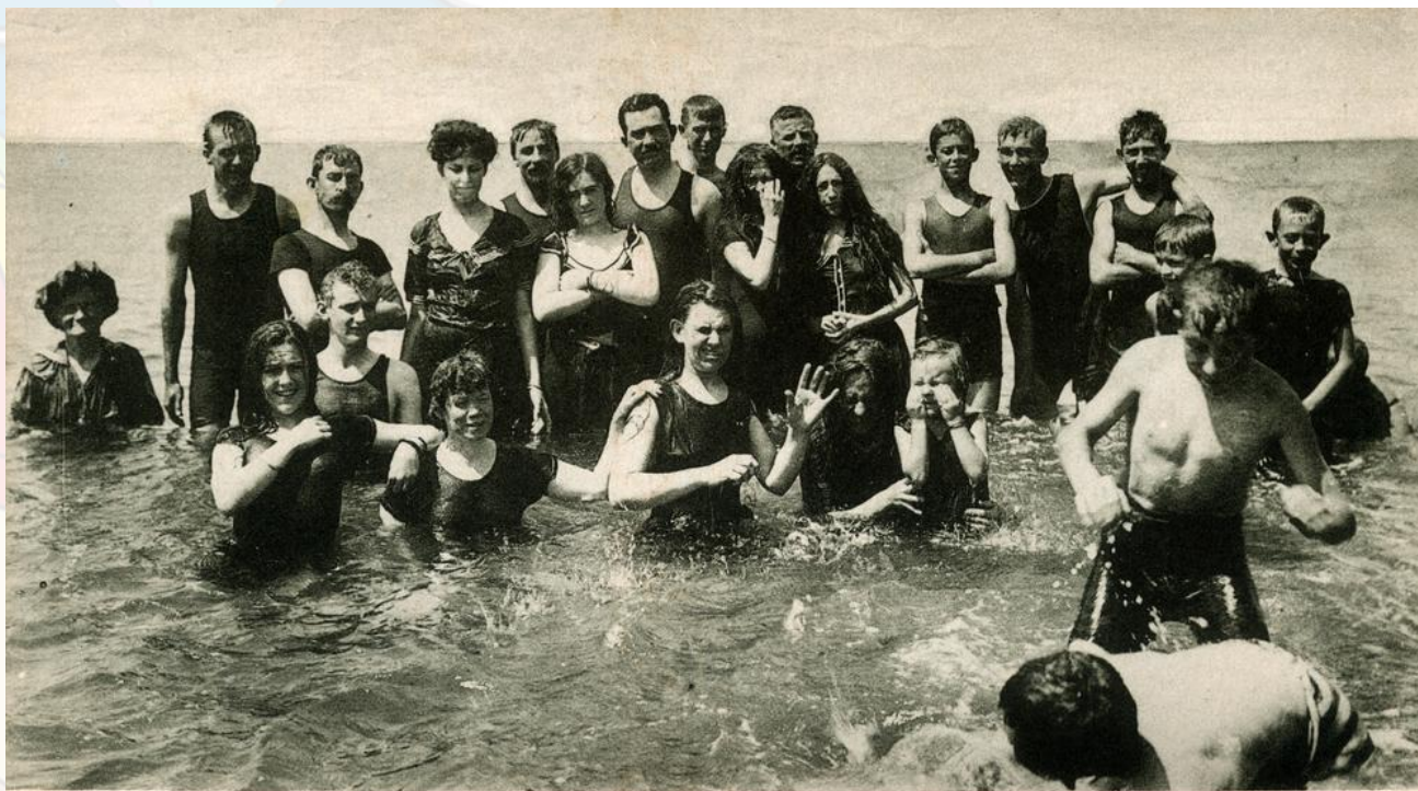
Mixed Bathing, Redcliffe, Qld.

Sunbathing wasn't in fashion back then, so Victorians would go to the beach fully clothed. 'Sea bathing' was done instead.