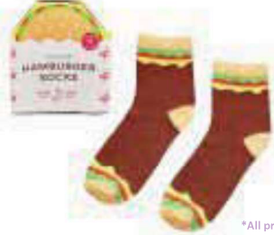
*All prices correct at time of printing

Express your love of burgers from head to toe with these fun and unique socks with a hamburger pattern. Packaged in a 95% recyclable hamburger-design novelty box, these would be the perfect gift for a burger buddy – or for yourself!