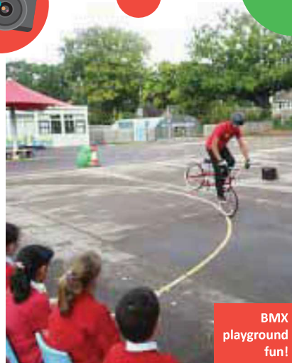
BMX playground fun!

So, I thought of using my old First News copies to wrap Christmas gifts up and recycle them. I took this picture of all of the presents.