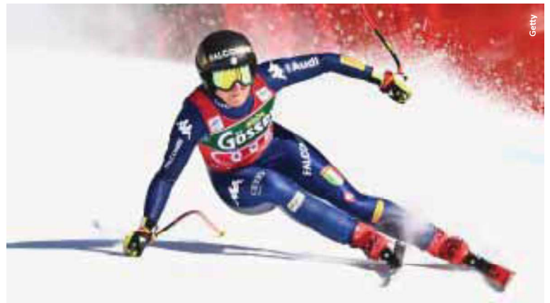
Italy's Sofia Goggia on her way to winning the downhill at the Alpine Ski World Cup meet in St Anton, Austria. She leads the downhill rankings by 60 points