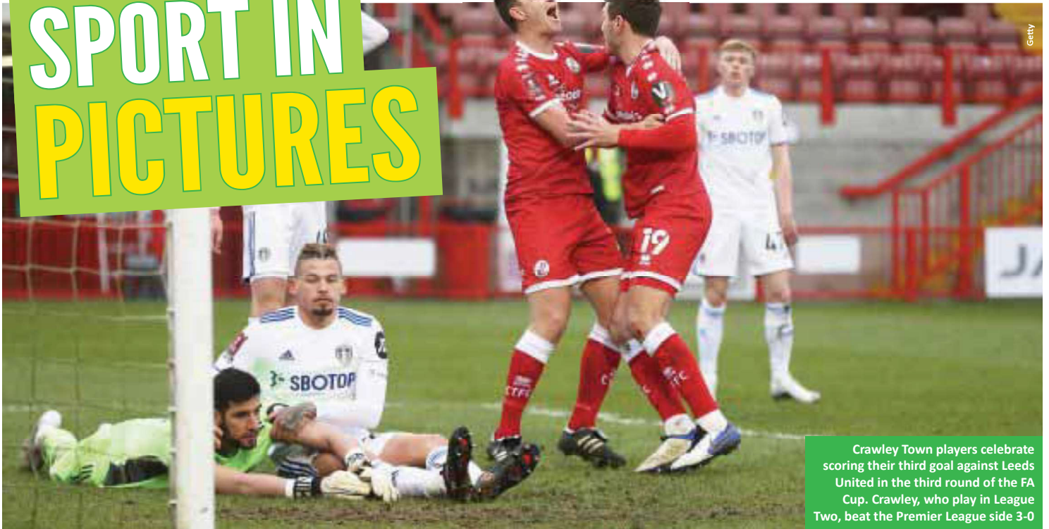
Crawley Town players celebrate scoring their third goal against Leeds United in the third round of the FA Cup. Crawley, who play in League Two, beat the Premier League side 3-0