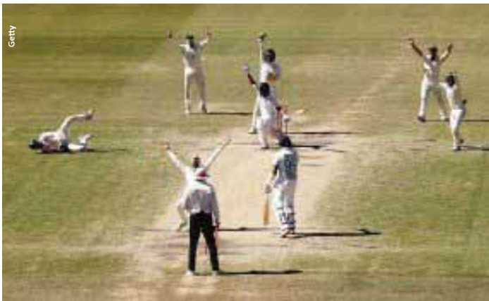
On day five of the third Test in the series between Australia and India in Sydney, India finished the day on 334-5, drawing the match and keeping the series at 1-1