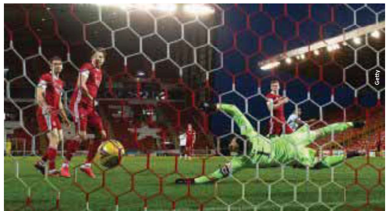
Rangers' Alfredo Morelos beats Aberdeen keeper Joe Lewis to make it 2-0 in their Scottish Premiership clash. The Gers won 2-1, putting them 22 points clear at the top of the table. SPFL Leagues 1 and 2 and SWPL 1 and 2 have all now been suspended due to COVID-19