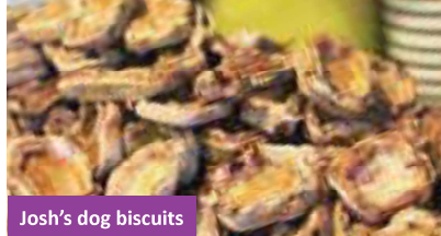
Josh’s dog biscuits

WE WANT TO HEAR WHAT YOU/YOUR SCHOOL IS UP TO