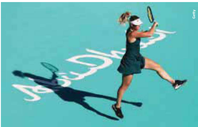
Marta Kostyuk of Ukraine plays against Sara Sorribes Tormo of Spain in the quarter-final of the Abu Dhabi Open. Marta staged a stunning comeback to win 0-6, 6-1, 6-4 and set up a semi-final against Russia's Veronika Kudermetova