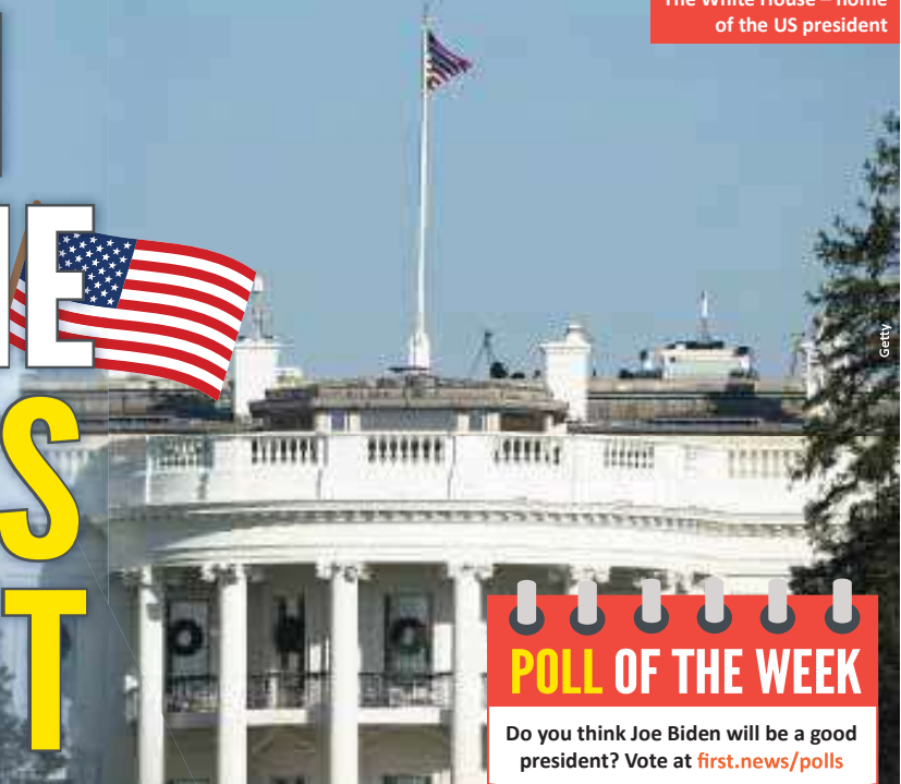
The White House – home of the US president