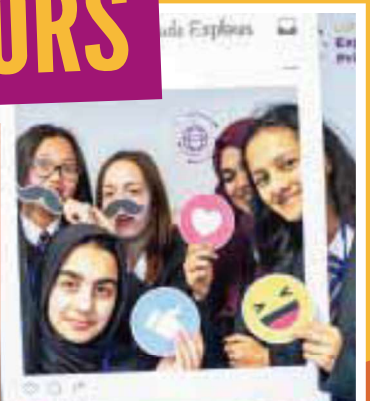
Team Iskort from Greenford High School won last year with their Tomodachi smartwatch app (left)