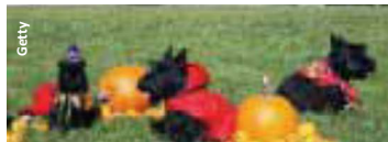
George W Bush (2001-2009) poses with Scottish terrier Barney. Below, India the cat, Miss Beazley and Barney dress up for Halloween