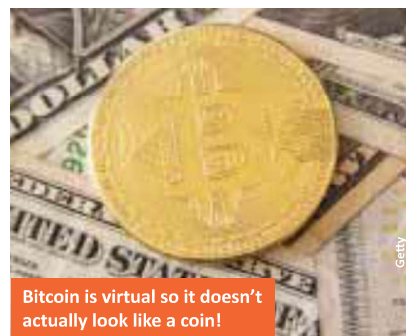
Bitcoin is virtual so it doesn't actually look like a coin!