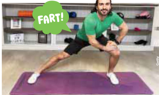
Joe Wicks had a funny moment recently when he let out a loud fart during one of his live workout classes. Awkward!

The study shows boys were more likely to be active than girls, but that girls adapted better to finding new ways to exercise during lockdown. It also highlighted that children from richer families are more active than those from poorer homes. The pandemic has had a big impact on activity levels, but people like Joe Wicks have been helping to keep kids active.