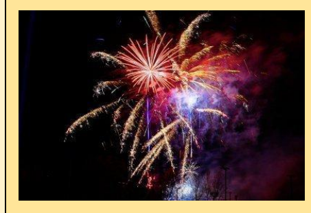
Science – Fireworks are often used to celebrate the New Year. Make some fireworks in a jar!

You will need: oil, water and liquid food colouring