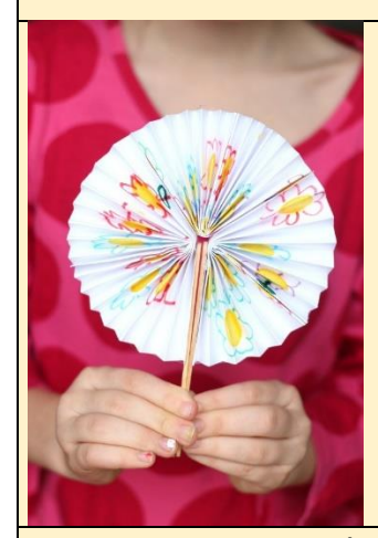
Art – Decorate and make a Chinese New Year fan.

You might make your own dragon or lion head out of cardboard to wear in your dance!